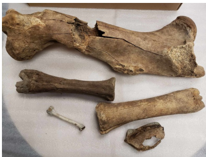
Archaeological items received by the Museum. L: horse, cow, heron and eagle bones. Bottom left: stone maul and cores. Bottom right: glass bottles, part of a leather shoe, ceramic bowl fragments, steel plate, all from Anderson ranch. (KMA No. 2023.40.1-14)

The Kitimat Museum serves as a repository for items uncovered in archaeological digs throughout our area. Last November, we were sent a number of artifacts collected by the archaeological firm Stantec during work near the LNGC terminal. These items represent multiple layers of Kitimat's history. The oldest is a stone hand maul dating to between 3,500 BCE (BC) and 500 CE (AD). These hardy tools were used by the Haisla and other Indigenous peoples for crushing, grinding, and hammering. Other archaeological items discovered were stone cores with flakes removed, several bird and mammal bones, and turn-of-the-century refuse from the Anderson family farm (1898-1926). These items were recently shown by Museum staff to visiting Grade 7 students from Mount Elizabeth School.