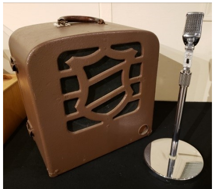
Speaker and microphone used by the Kitimat Judo Club. KMA No. 2023.2.1a-b