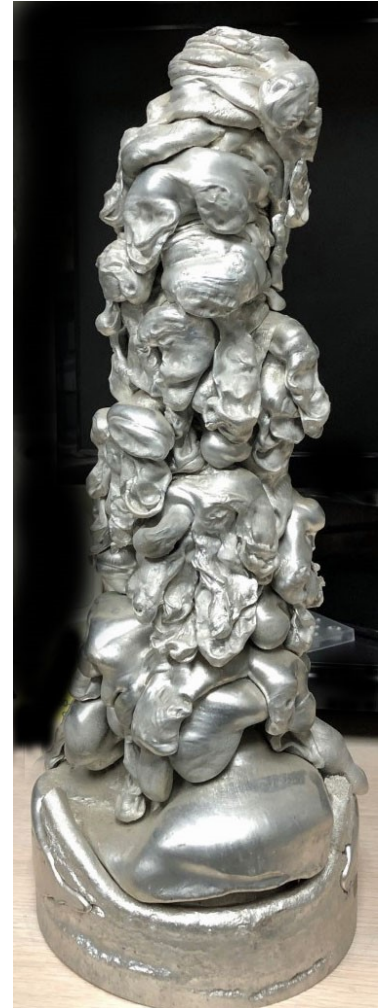
Slag sculpture, KMA No. 2021.48

To reach out with more information you can contact the Museum at 250-632-8950 or email info@kitimatmuseum.ca