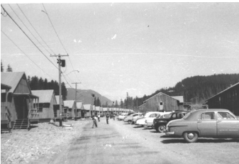
Housing at 'Riverside' camp, near Riverlodge ca. 1955.