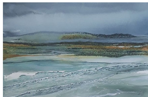
'Tides Out', Watercolour