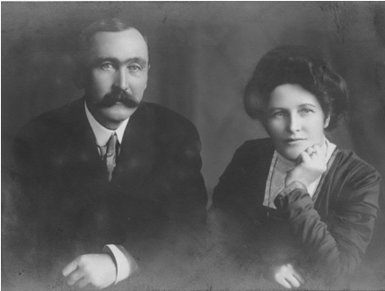
Mary Richmond Collection, KMA No. 2002.50

While working through our collections, a photo recently came up that piqued our interest. The photo had never been properly accessioned, and only contained a note with some basic information. We