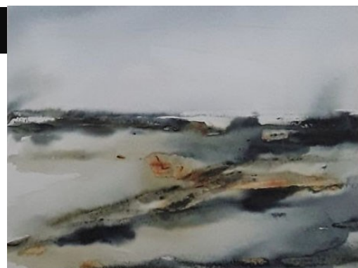
'Low Tide', Watercolour