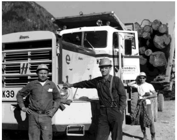
Three men posed in front of a Saunders Hauling Ltd. truck. These men are unidentified—any information on who they are would be appreciated.