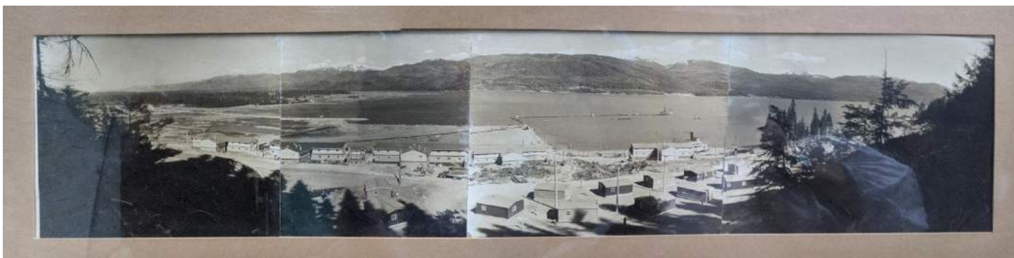
Panoramic photograph of Smeltersite ca. 1954.