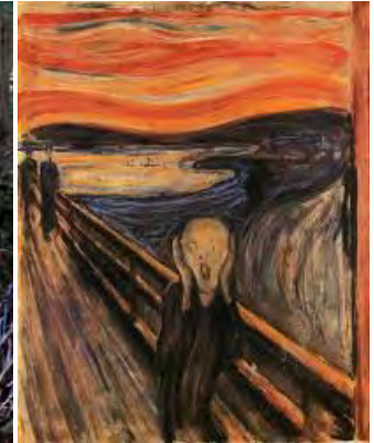
Edvard Munch The Scream 1893, oil, tempera and pastel on cardboard National Gallery Oslo, Norway