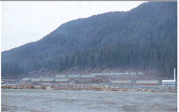
Smeltersite housing ca. 1955