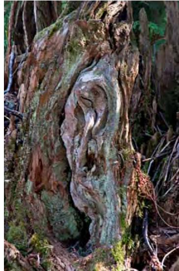
Image of the screaming knot, April 23, 2011

It was probably sometime in 2012, that I first came to see the tormented, screaming face on that stump as emblematic of the environmental crisis facing our planet. So, I began calling the project "The Scream of the Forest" or alternatively "The Forest is Screaming".