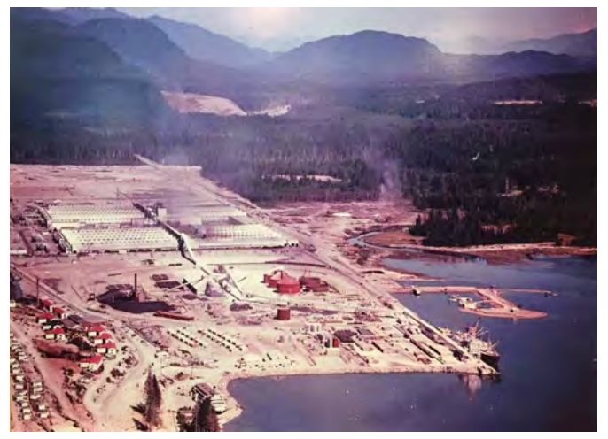
Smeltersite, mid 1950s. KMA No. 2019.6