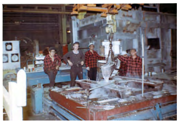
Alcan Casting at the smelter, no date. KMA No. 2019.9

Ria Dyck (Veen Huizen) via Barb Campbell donated thirteen colour photographs of the Alcan smelter casting area.