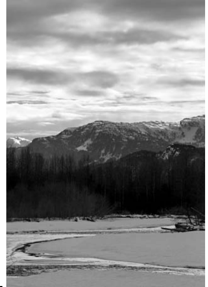
Photo: Kitimat River, February 27, 2014

to photojournalism to landscape and fine – were in black and white. Then came colour film and now cameras with millions of digital colours are everywhere, mainly on phones in holsters on peoples' belts. The versatility of the digital has brought a renaissance in black and white photography. In competition with digital colour, black and white is now in the eyes of artists around the world."