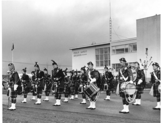
Kitimat Pipe Band, Remembrance Day, 1961