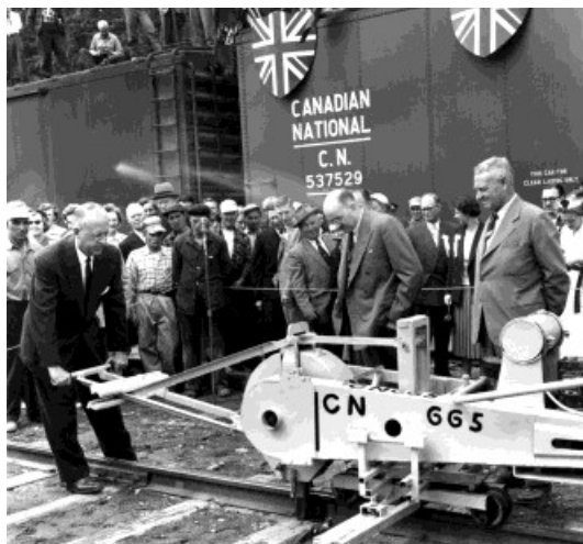
Setting the last spike, Kitimat Canadian National Railroad grand opening ca. January 20, 1955.