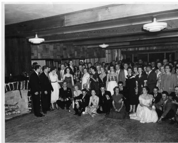
Celebration at the former Rod & Gun Club building, ca. 1953. Ludwick Collection, KMA No. 2018.17