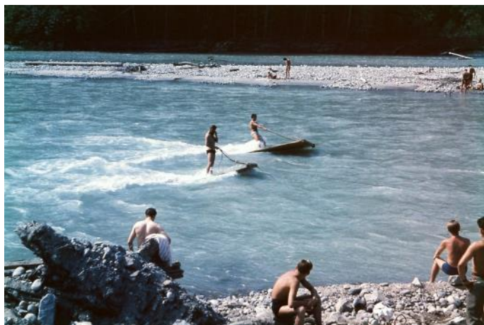
Surfing on the Kitimat River, ca. 1960.