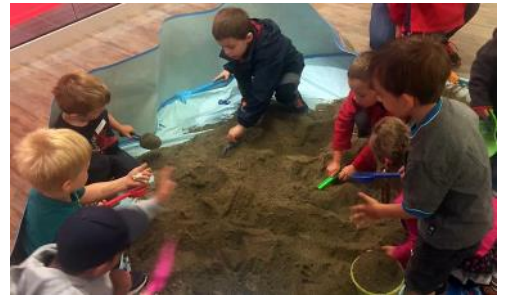
Budding paleontologists search for Colossal Fossils .

The programs have a strong educational component that allow participants to learn and explore town history, First Nation's culture, world culture, and the natural and physical sciences through playtime and crafts. Student positions are funded by Young Canada Works in Heritage Institutions, Canada Summer Jobs, the District of Kitimat Top-Up Program, and BC Community Gaming.